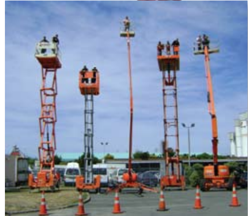
Tank Maintenance staff on a EWP training course at Hirequip in Christchurch.

Brendon Ross EWP Training - South Island bross@hirequip.co.nz 0274 775 678 Kelvin Munro EWP Training - North Island kmunro@hirequip.co.nz 0274 700 839